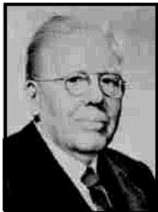
Melvin Jones 1879 - 1961